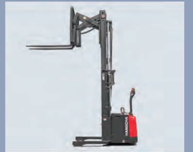
Travel speed is reduced automatically when the forks are lifted past a specified height.