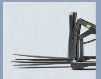
The forks' tilting function is easy for loading and unloading pallets.