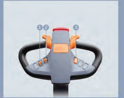
FREI Multi-Function Tiller 1: Forks move forward / backward 2: Lifting / lowering of forks 3: Forward / backwards tilting of forks