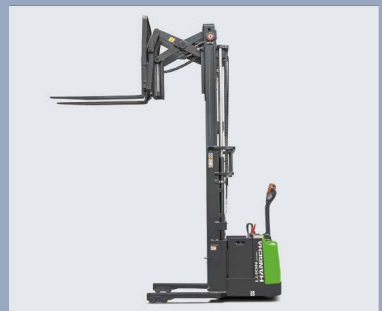
Travel speed is reduced automatically when the forks are lifted past a specified height.