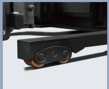
The structure of rotary load wheel offers better rolling ability and stability.