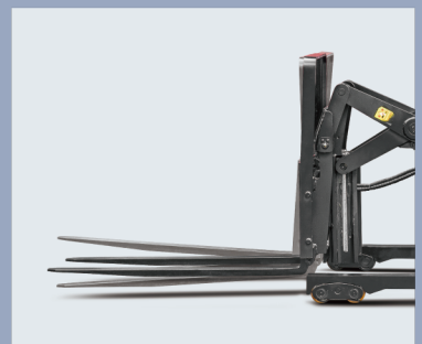
The forks' tilting function is easy for loading and unloading pallets.