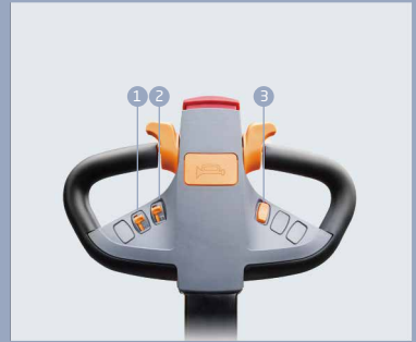
FREI Multi-Function Tiller 1: Forks move forward / backward 2: Lifting / lowering of forks 3: Forward / backwards tilting of forks